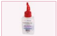
Press Fitting Lubricant (100ml)