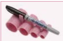
Depth Gauge & Pen