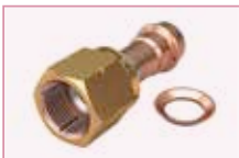
SAE45 Stainless Flare - Brass Nut - Copper Washer