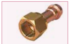
SAE45 Copper Flare - Brass Nut