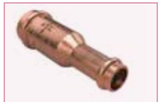
Long Reducing Coupler