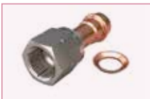
SAE45 Stainless Flare - Stainless Nut - Copper Washer