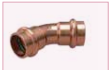
45° Obtuse Elbow