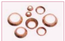
Copper Flare Washer